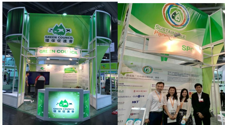
Booth in Eco-Expo Exhibition