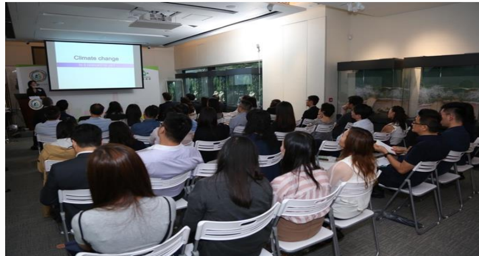
Seminars on Sustainable Procurement